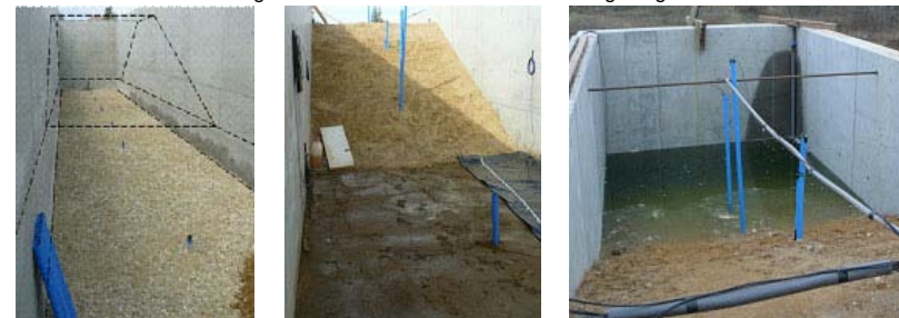
Aquifer “sandy gravel” after installation (left); large scale dam model (middle); preliminary tests (right).