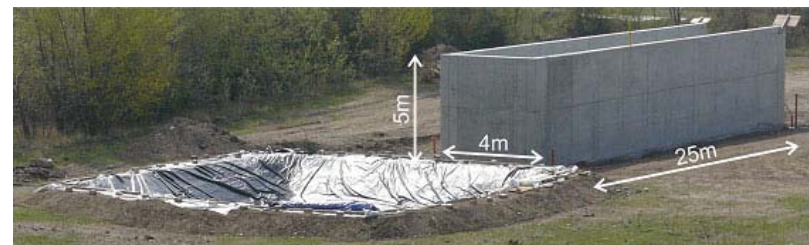
Testing plant of the Institute for Geotechnics, Vienna University of Technology, for large scale model tests on dams including subgrade.

In the scope of the site visit the large scale testing plant of the Institute of Geotechnics, Vienna University of Technology, located in a quarry north-east of Vienna will be presented, where large scale model tests on a dam section including the subgrade are currently performed. The experimental tests serve to investigate the time-dependent behavior of groundwater flow and to quantify the outflow from relief elements by underseepage of dams during hydraulic loading. The relief stone columns are installed on the landward dyke toe to reduce the risk against hydraulic failure during simulated flood stages. At the same time they increase the safety factor for the stability of the dam.